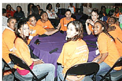
YMCA teens gathered at the Teen Leadership Summit in Louisville to learn the steps to college.

In March, 425 YMCA teens representing seven states kicked off On the Air, Off to Orlando , a contest sponsored by KnowHow2GO and the YMCA of the USA . The teens, who were gathered at YMCA Black/Hispanic Achievers Teen Leadership Summits in Louisville, KY and Raleigh, NC, were also introduced to the KnowHow2GO campaign. After viewing the TV and radio PSAs, they launched hundreds of paper airplanes—replicating the TV PSA— to show their enthusiasm