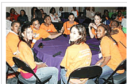
YMCA teens gathered at the Teen Leadership Summit in Louisville to

All teens affiliated with local Ys are eligible to write, perform and produce PSAs telling their